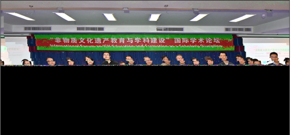
Figure 1. Group Photo of Some In-Person Participants at the International Forum. December 5, 2020. 2

curricula, and the reality of who gets to be a student or professor. Building on Transforming Our World: The 2030 Agenda for Sustainable Development adopted by the United Nations (UN) in 2015, Bamo Qubumo, a folklorist at the Chinese Academy of Social Sciences, focused on the cross-cutting concerns between the UN sustainable development goals and the transmission of, and education about, ICH. Bamo stressed as well the further linking of heritage education with UNESCO's recent documents related to the international cooperation mechanism for ICH safeguarding, so as to cross-sectoral policymaking.